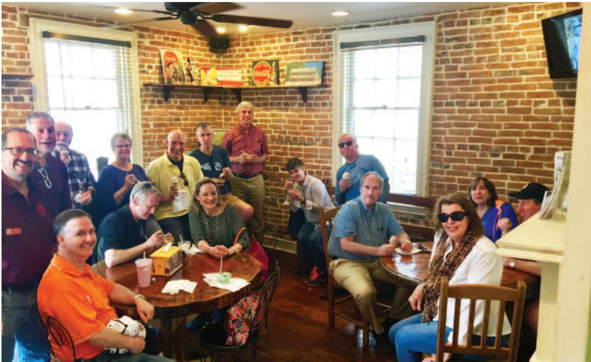
Left: Drive and Diners enjoying some ice cream in Hershey.