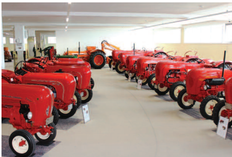
Above: A few original Porsche tractors lined up.

The next stop in the Dream Garage is the dream diner. This is another beautifully done '50s Art Deco diner, no detail missed. It encompasses two floors and the lower floor has a competition quality hardwood