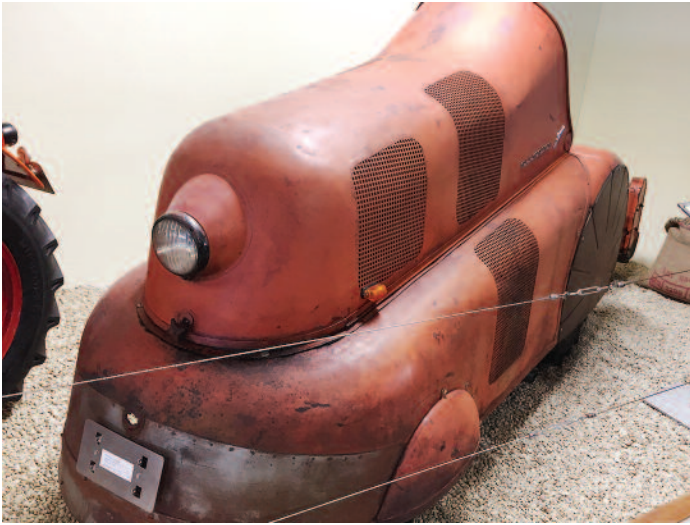
Left: An extremely rare Porsche P 312 coffee tractor which is in the condition it was when he found it in South America.